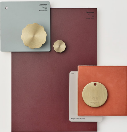
Confident Colour Palettes