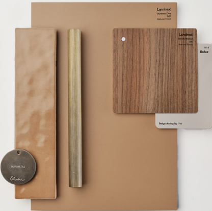
Warm Minimalism Palettes