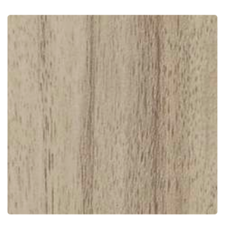
Avignon Walnut N C S