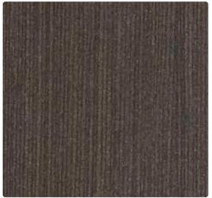
Licorice Linea N S