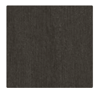
Black Birchply N C