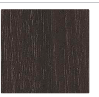
Blackened Legno N C