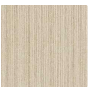
Oyster Linea N S