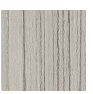
Chalky Teak N