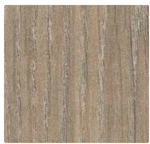
Delana Oak N C