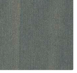
Smoked Birchply N