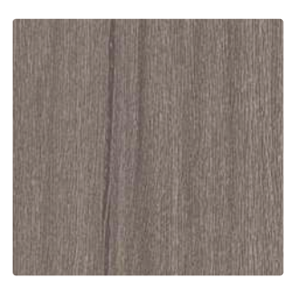
Greyed Woodland N C