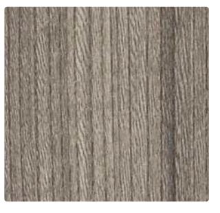
Lustrous Elm N