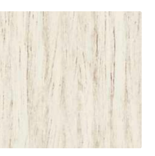
Alaskan N NU