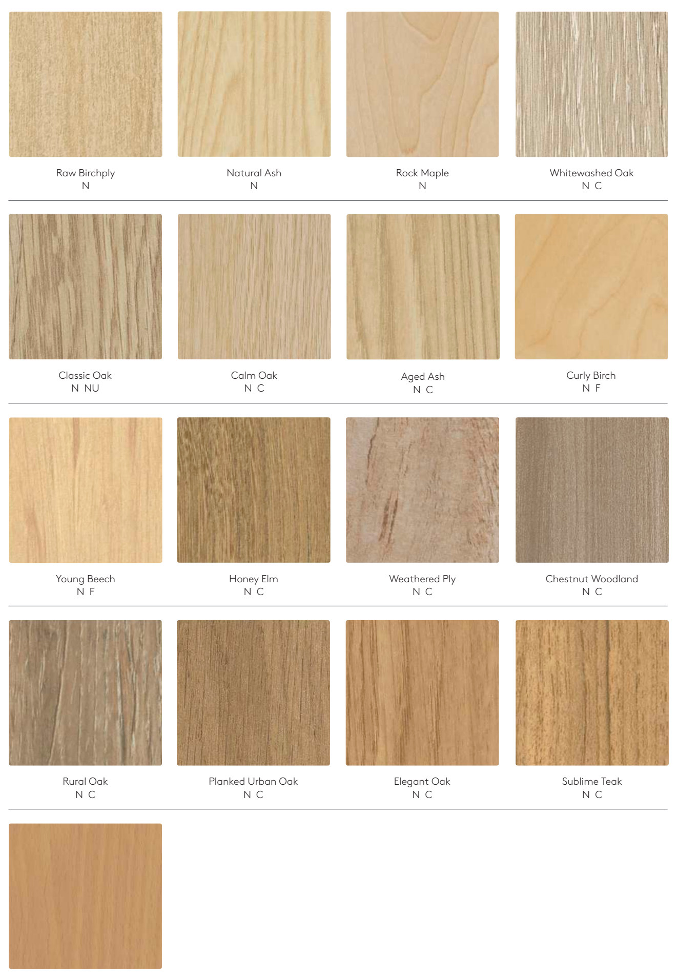
Select Beech N F