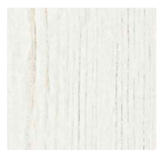
White Painted Wood N