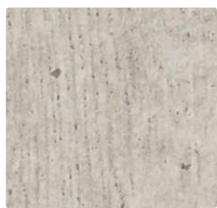
Concrete Formwood N C