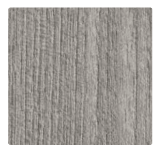
Fox Teakwood N C