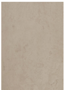
Benchtop Grey Cement

The warmth of Silky Maple cabinetry combined with Grey Cement benchtops provides a soft tranquil feel to your space. Add light timber tones, glossy metallics and hints of green that contrast beautifully with grey and pick up tones in the cabinetry. Add edge with simple silver hardware and pendent lights – just one, or cluster several, above the island bench to complete your kitchen's look and flood your benchtop with light.