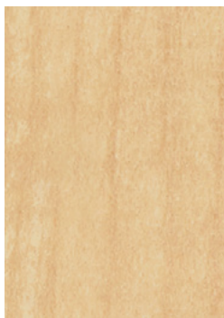
Cabinetry Silky Maple