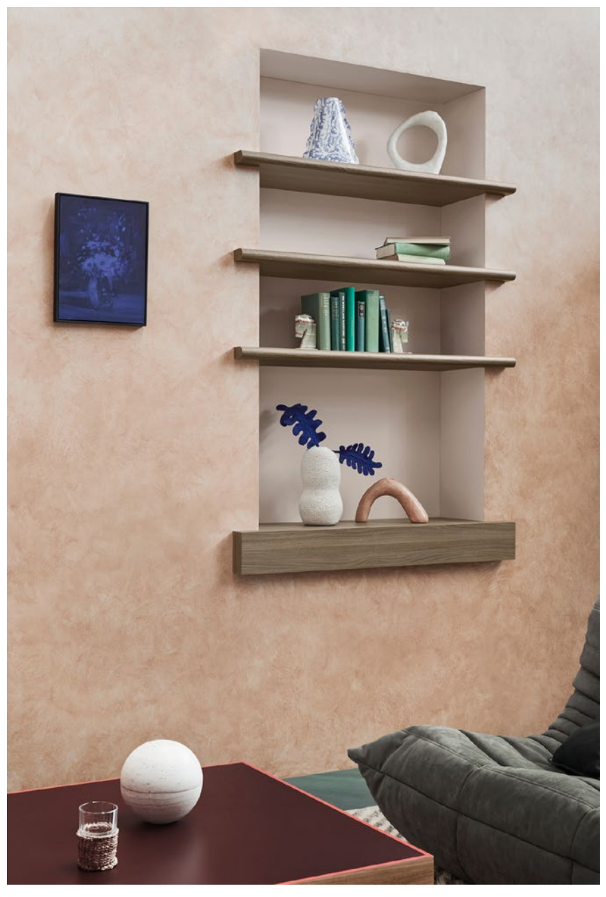
Shelves feature Laminex Danish Walnut. Design by YSG Studio.

This Design Guide provides on-trend ideas for working with laminate and decorated board, with a focus on contemporary colour and texture, and sculptural curves. It shows how Laminex laminate can play a key role in realising your dream home, as part of a broader material palette or as a hero in its own right.